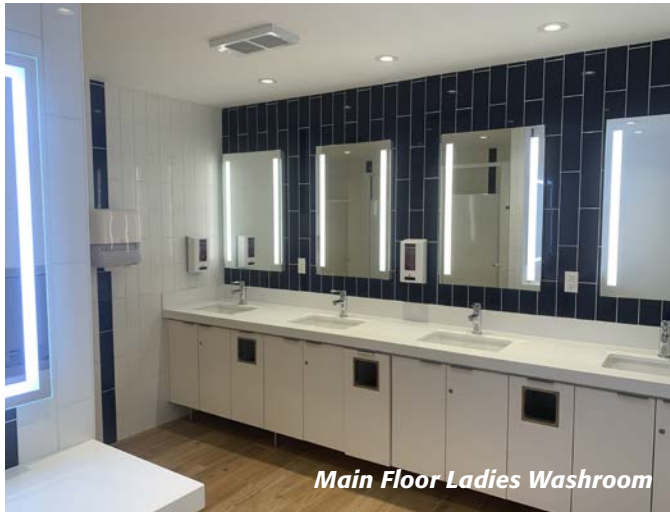
Main Floor Ladies Washroom

The Administration Committee spent weeks modelling various scenarios of membership levels to ensure we could maintain the loan to an extremely low membership level.