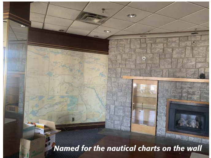
Named for the nautical charts on the wall

With membership endorsement, the Renovation Steering Committee was formed in January 2019, reporting directly to the Board of Directors. The committee identified a list of 10 construction companies to request quotes from with four responding to the RFQ. After careful review of their written responses as well as two face-to-face meetings, the Committee unanimously awarded the renovations to Dalton Works as the general contractors.