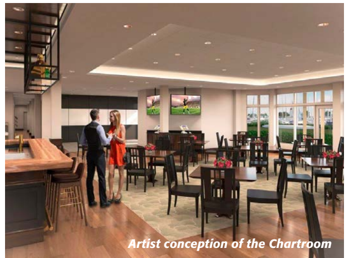
Artist conception of the Chartroom

Recognizing the need to maintain tight control and management of the projects, the contracts were divided into a multi-stage renovation program. Each project or stage of the renovation would consist of a project scope,