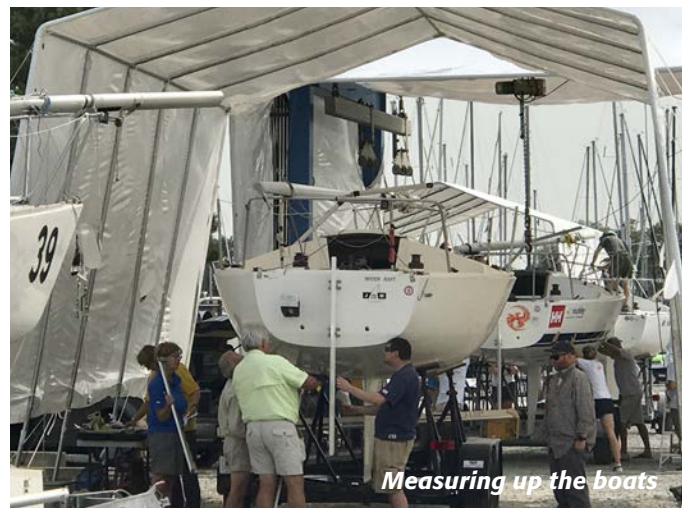
Measuring up the boats