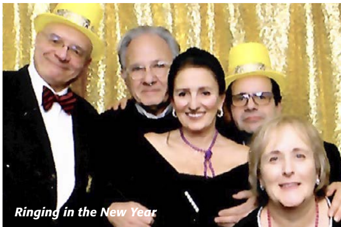
Ringin' in the New Year

The major highlight of the past decade is PCYC's 75th Anniversary Celebration over three days in August 2011. The weather was perfect, the food delicious and the efforts of the organizing committee and many volunteers made this a weekend for the history books (literally). We kicked off the weekend with a Dixieland band on Friday evening followed by a costume party and banquet where participants dressed up in 1930's garb to commemorate the founding of PCYC in 1936. Speeches from local dignitaries, garden parties, trivia contests, 1930's outdoor movies, live bands, a blind dinghy race, dunk tank, lawn games for kids and adults and even a dog show kept the party going strong all weekend long. For many of us, it was a birthday party like no other as well as a powerful reminder that PCYC is a very special place.