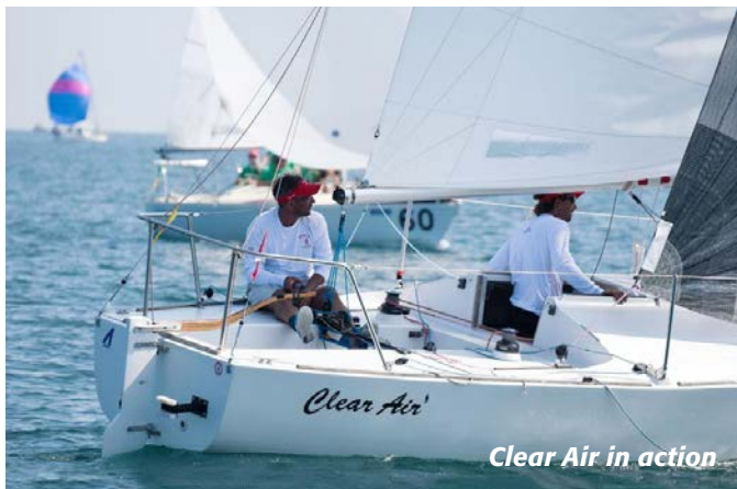
Clear Air in action