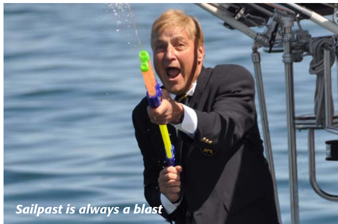
Sailpast is always a blast

In more recent times, intrepid PCYC members have found new, virtual ways to gather and celebrate. We enjoyed an exceptional, extended Speakers' program this winter as well as educational wine, beer and cider tasting events accompanied by spectacular takeout menus from PCYC's kitchens. These events were highlights in our otherwise quiet and solitary 2021 winter season.