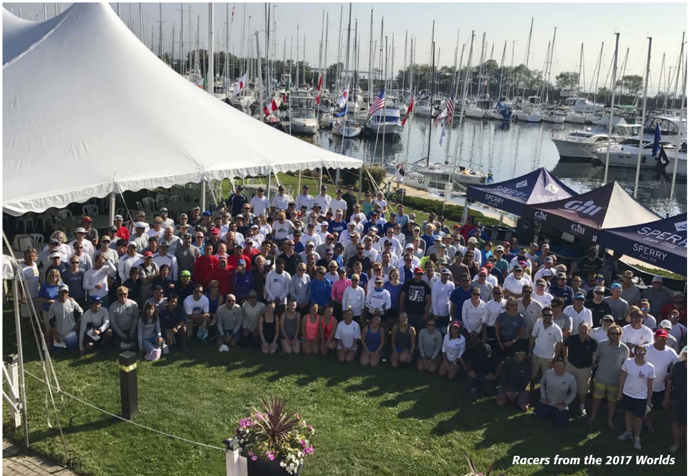
Racers from the 2017 Worlds