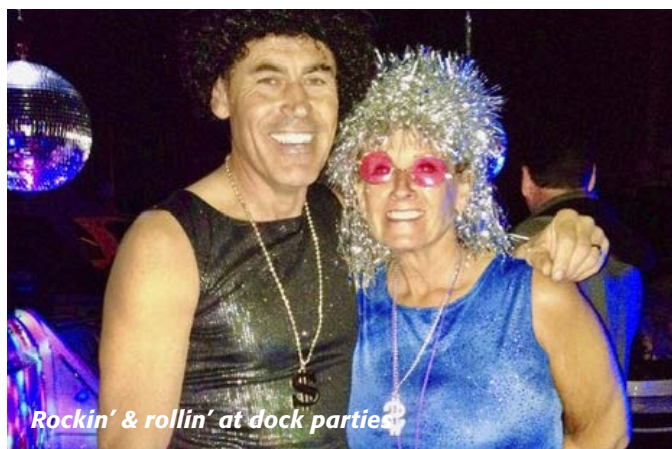
Rockin' & rollin' at dock parties

Those members who joined PCYC in the last two years will have not yet experienced the full program of the Club's social events. The pandemic has clearly hampered our ability to gather and celebrate. Now hopes are high that we will be able to get together in large numbers soon once again. Let the parties begin! After all, PCYC stands for "Party Central Yacht Club", doesn't it?