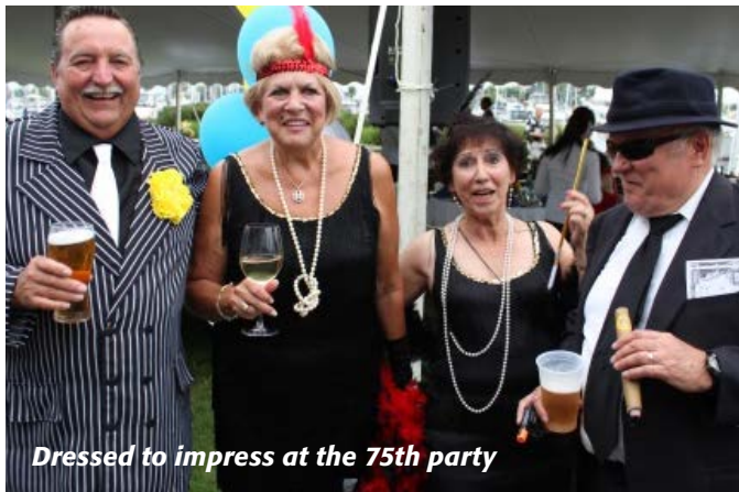
Dressed to impress at the 75th party

The major highlight of the past decade is PCYC's 75th Anniversary Celebration over three days in August 2011. The weather was perfect, the food delicious and the efforts of the organizing committee and many volunteers made this a weekend for the history books (literally). We kicked off the weekend with a Dixieland band on Friday evening followed by a costume party and banquet where participants dressed up in 1930's garb to commemorate the founding of PCYC in 1936. Speeches from local dignitaries, garden parties, trivia contests, 1930's outdoor movies, live bands, a blind dinghy race, dunk tank, lawn games for kids and adults and even a dog show kept the party going strong all weekend long. For many of us, it was a birthday party like no other as well as a powerful reminder that PCYC is a very special place.