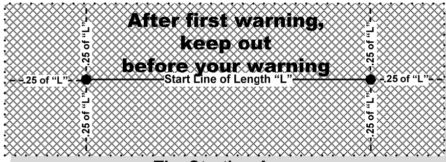
The Starting Area

After the first warning signal for a race and prior to her warning signal, a sailboat shall keep clear of the starting area that extends one-quarter of the length of the starting line ahead of and behind the starting line. It shall also extend one-quarter of the length of the starting line past either end of the starting line